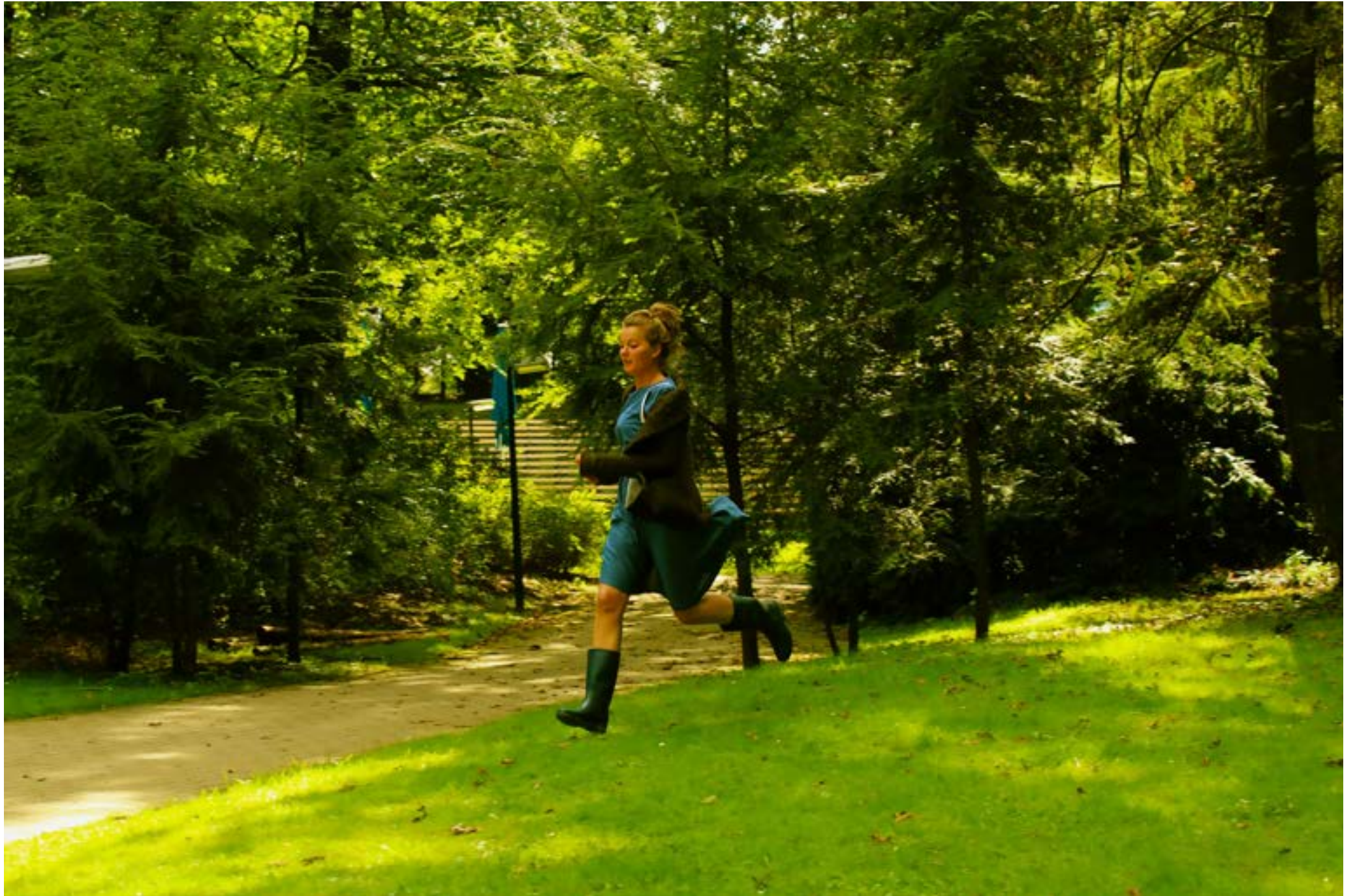
Velp (NL), 2012, Site specific performance