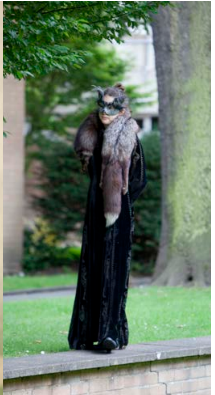
"It's a big decision how one prefers to die."