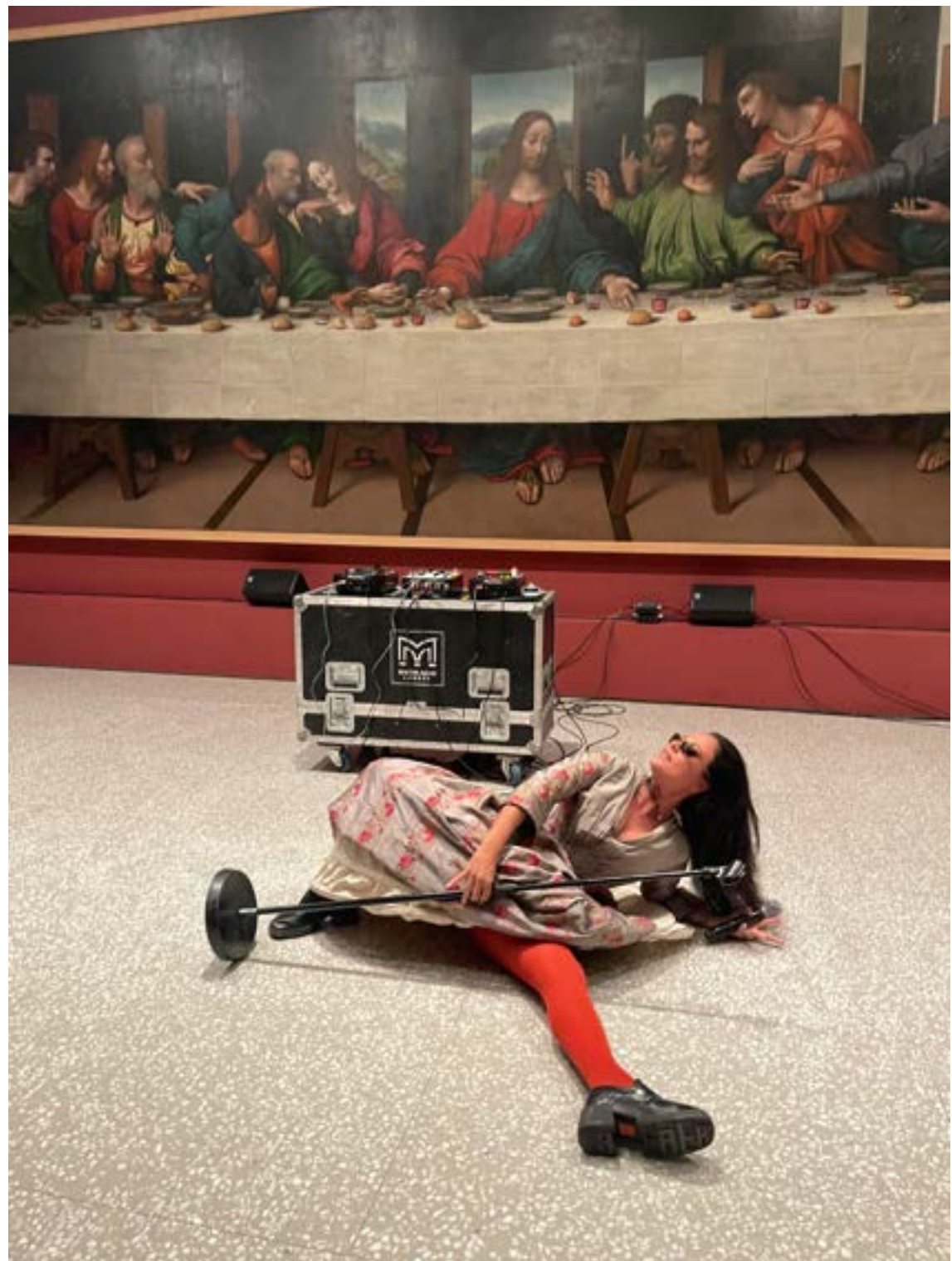
Holiday With My Baby (the musical) Royal Academy of Arts, 2023